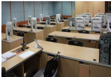
Room 215 in Jeongui Hall