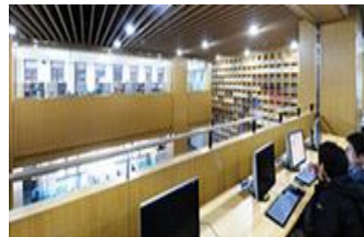
Multimedia Room on the 2 nd floor of Main Library