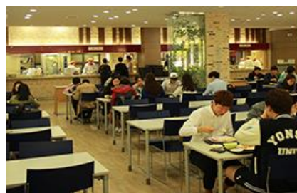
Student Cafeteria II the 1 st floor of Student Union Building