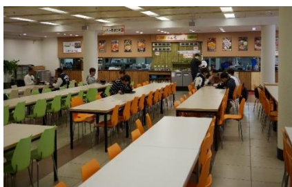
Student Cafeteria I the 2 nd floor of Yonsei Plaza