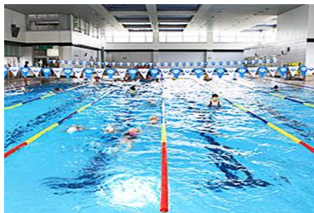
Fitness Center (Swimming Pool)