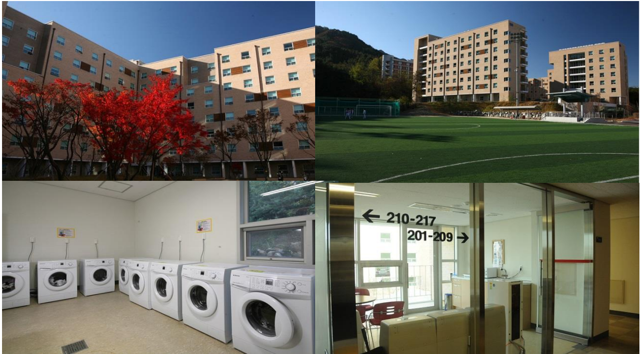
(▲ SNU dormitory buildings and facilities)