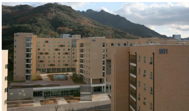
(▲ SNU Gwanak Residence Halls for Graduate Students)