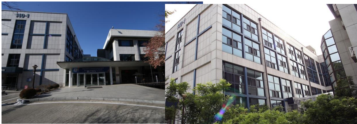
(▲ GSIS Buildings)